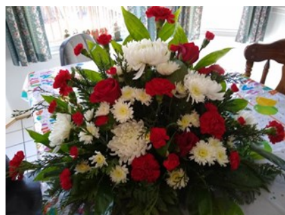
Below: Altar Flowers make beautiful bouquets