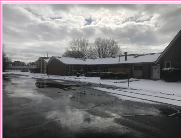
Winter Storm January 23rd—Notice the star in the clouds