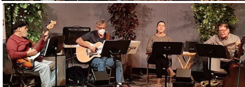
Above: Chestnut Circuit Riders Harmony House Jan14