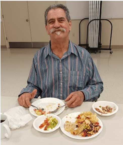
Cinco De Mayo June 5th Potluck and Trivia after the 10AM service