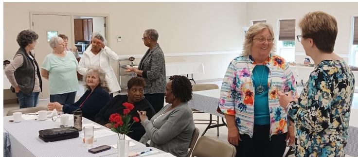
United Women in Faith Spiritual Life Retreat via ZOOM. Wesley hosted 5 other churches to attend in person with refreshments