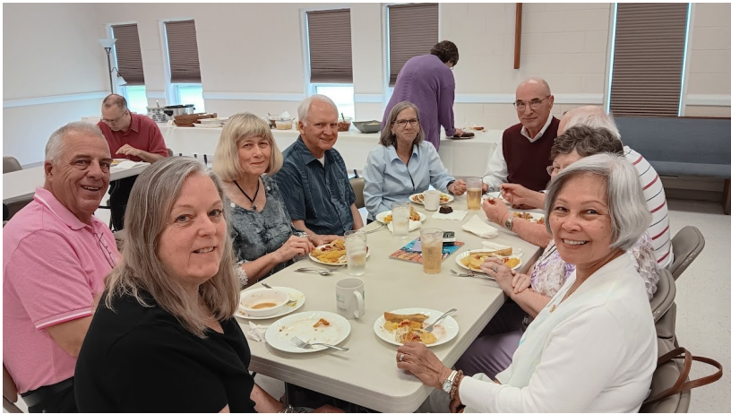
Bottom Right—Mother’s Day Roses