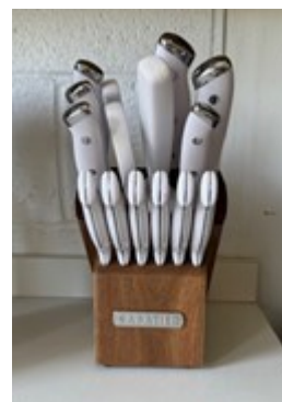
From the Kitchen crew: Thank you very much for the new knife set and block. We will take good care of it.