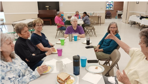
May 4—Church Clean up day Many thanks to all that helped!

Also thanks to those who, anonymously, have been here for any work that needs to be done at the church (inside or out).